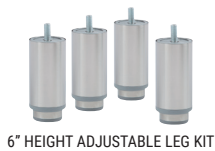
6" HEIGHT ADJUSTABLE LEG KIT